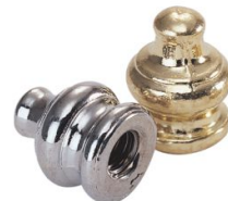
H28 13 x 18mm Nipple 2000 pcs/ctn