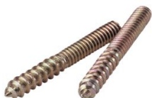
H19-15M 1 1/2" Lag Screw 4000 pcs/ctn