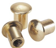
H30 15mm Cap Nut 5000 pcs/ctn