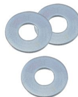
H55 1 x 15mm Washer 20000 pcs/ctn