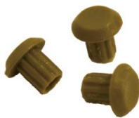
S35 16mm Plastic Cap Nut 10000 pcs/ctn