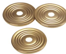
ML2 45mm Metal Lid 2000 pcs/ctn