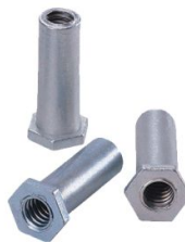
H14-10M 1" Ferrule 2500 pcs/ctn