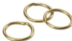
H54 1.6 x 10mm Alu. Ring 50000 pcs/ctn