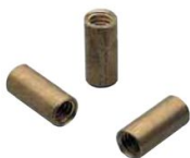
S34 8 x 15mm Coupling, Brass 5000 pcs/ctn