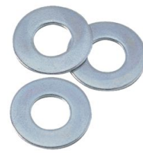
H56 1.2 x 18mm Washer 10000 pcs/ctn