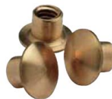
S39 14 x 10mm Cap Nut, Brass 4000 pcs/ctn