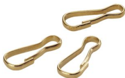
H41 16mm Hook 50000 pcs/ctn