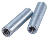
H13-15M 1 1/4" Coupling 2500 pcs/ctn