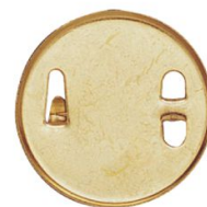
MD25 1" Dia Pin Badge 5000 pcs/ctn