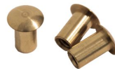
S33 14 x 17.5mm Cap Nut, Brass 2500 pcs/ctn