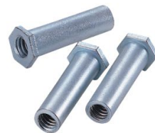
H14-15M 1 1/4" Ferrule 2500 pcs/ctn